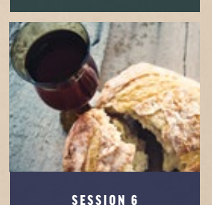
False Witness and Coveting