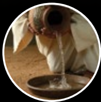
SESSION 4 Mercy in Service