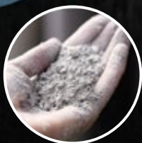
SESSION 1 Mercy in Ashes