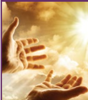
WEEK 1: HOPE Zechariah