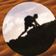
Session 6 GUIDED TO PERSEVERANCE